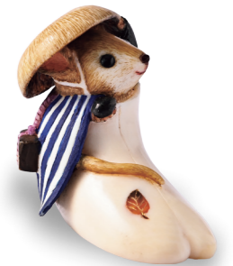
THE GOLDEN NETSUKU AWARDS CHAIRMAN'S AWARD

In the moon-like work, hares said to live on the moon, are pounding an elixir of immortality.