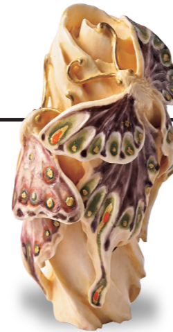
THE GOLDEN NETSUKU AWARDS GRAND PRIX

A lady puts her hand on a card hidden in her chest. However, they are all cardsharps! Who will win?