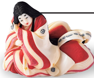
『 Listening to insects 』 RYUSHI (1934~) H4.2cm

During the Heian period (794-1185), a dynastic culture centered on the emperor and aristocrats flourished. Escaping the influence of foreign art, an elegant and refined national culture was established. The origin of Japan's unique culture can be seen here. Please look at netsuke based on the elegant dynastic romance of the Heian period and the gorgeous works typical of Kyoto.