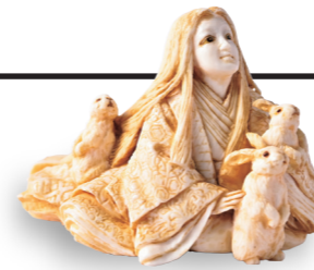
『 Nostalgia 』 TETSURO(1960~) H3.2cm

A beautiful Heian woman who looks like she came out of a Tale of Genji picture scroll.