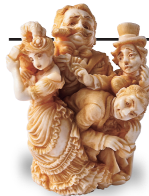
THE GOLDEN NETSUKU AWARDS GRAND PRIX

*This award is given to the best overall work among the new