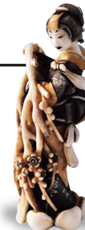
THE GOLDEN NETSUKU AWARDS AWARD OF EXCELLENCE

From the stage where a nobleman looking for his deceased lover sees a butterfly and overlaps it with his lover.