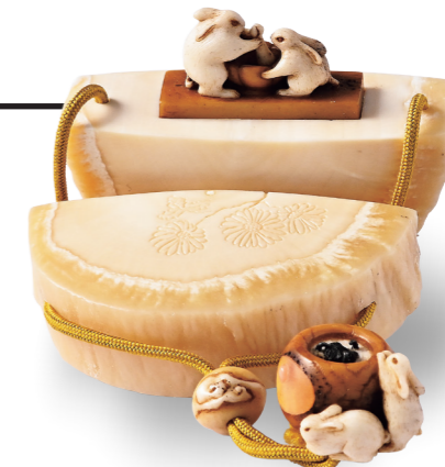
THE GOLDEN NETSUKU AWARDS AWARD OF EXCELLENCE

She undertakes to write love letters on behalf of others and fulfills even the most unrequited love.