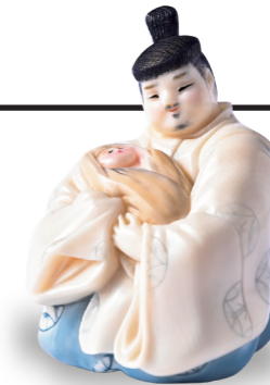
『 Hikaru Genji 』 HOSEN (1942~) H4.6cm

Murasaki Shikibu is considered the founder of women's literature as the author of "The Tale of Genji."