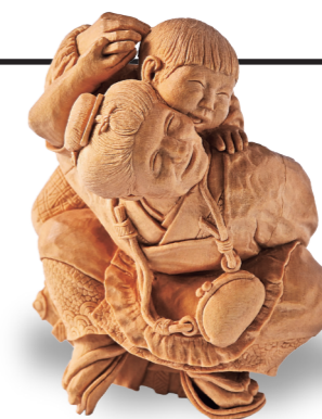
『 Grandma 』 ITARO (1961~) H5.1cm

The high growth of the Showa period was supported by the businessmen who commuted by crowded trains.