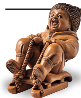
『 Sled Play 』 TAISEI (1953~) H4.0cm

The Showa period (1926-1989) evokes nostalgia. Even today, revivals in fashion and music are occurring and being reevaluated with a fresh impression. In the netsuke world, the 1970s saw the emergence of an artist consciousness and an increase in artistry. Nostalgic netsuke look back on the “Showa Period” when the rise of popular culture shined brightly, as it was also called the “100-million-people middle class.”